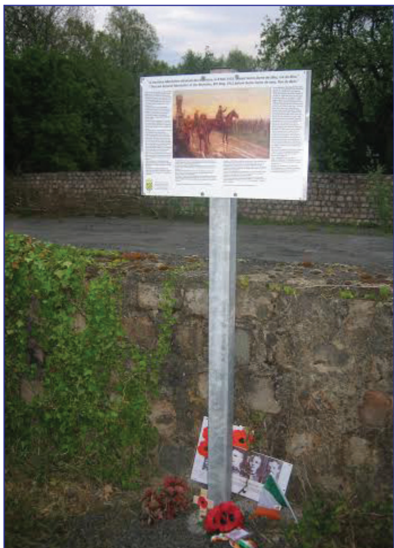
The present location on the Rue de Bois.